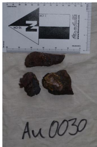
Figure 1. AU0030 returning 1.3% Ni, 0.8% Co, 0.3%Bi and 19ppm Ag

"While it is still early to assess what the ultimate potential could be, the signs at this stage are very encouraging and exploration activities will continue as we work to unlock its potential."