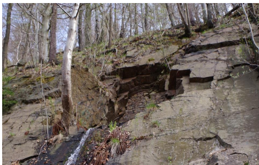
Figure 2. Adit Stolln 7

Stolln 7, located on the Schwarzwasser river was driven into a steep rock face around 1950 to explore potential uranium mineralisation. Instead of uranium the miners encountered a Bi-Co-Ni vein striking WNW-ESE. A minor amount of material was extracted and the adit was closed and sealed (Figure 2).