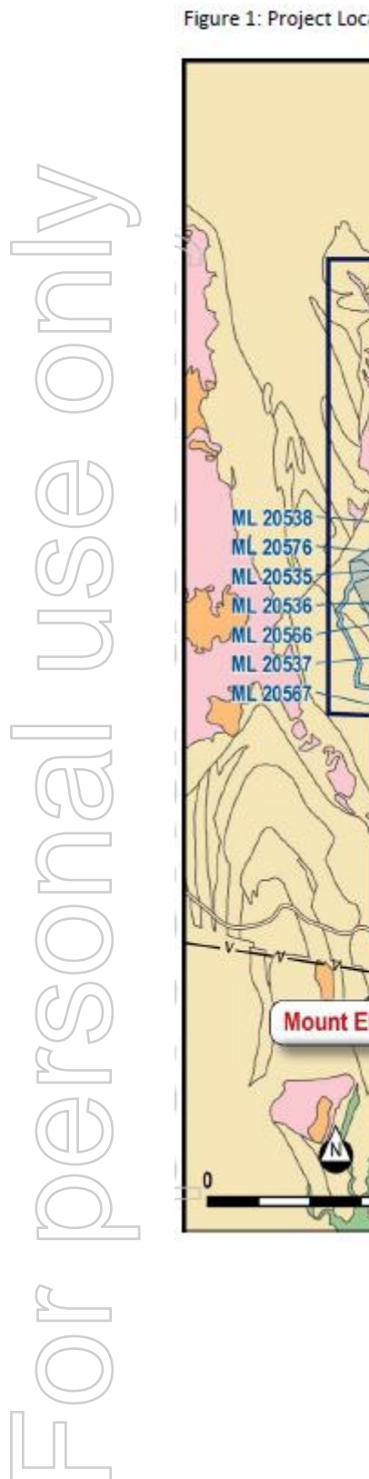
Figure 1: Project Location Plan