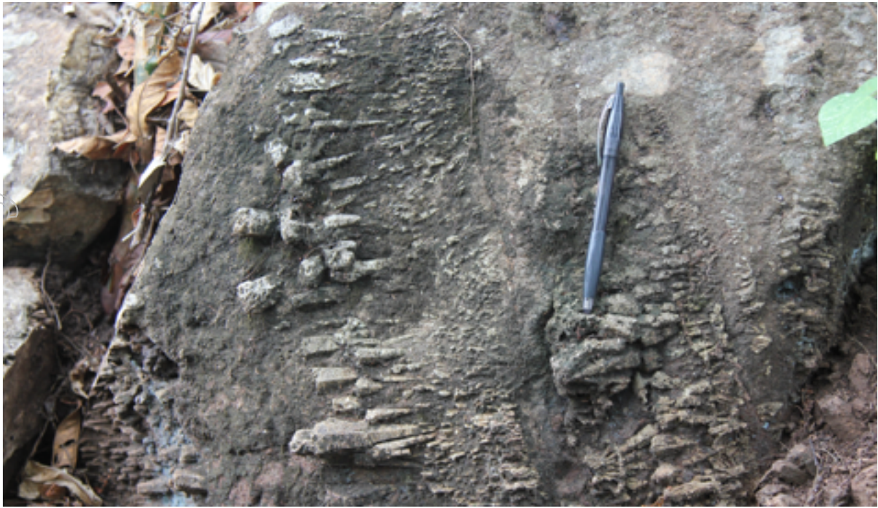
Figure 5: Large Hexagonal Bastnaesite Rare Earth Crystals in the Twiga Zone