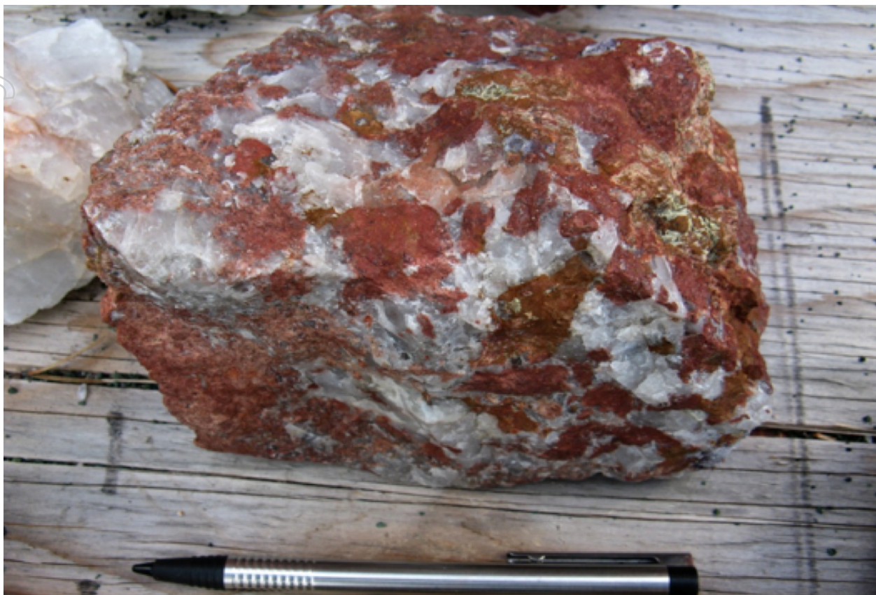
Figure 3: A sample of North T mineralised ore. Rare earths are contained within the red bastnaesite minerals and white material is quartz waste rock. Vital intends to initially separate the bastnaesite materials via conventional ore sorting technology.

Tomra Systems ASA have been engaged to undertake a program to produce a high grade rare earth concentrate utilising their XRT sorting technology. Vital intends to use ore sorting technology to initially concentrate its bastnaesite bearing North T and Tardiff zone into a high grade concentrate prior to shipping for hydrometallurgical treatment.