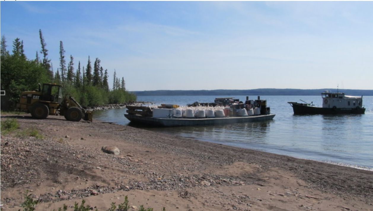
Figure 2: Ore being loaded onto Barge at Nechalacho Barge Landing prior to transport to Yellowknife for dispatch to the various laboratories for metallurgical testwork

During the quarter, Cheetah commenced three process testwork programs on existing bulk sample material from the North T Zone. A total of more than 60 tons of ore was successfully loaded on barges and shipped to Yellowknife with samples then being sent to the various laboratories for testwork. The Company is very pleased with this achievement as it is essentially mirroring a potential logistics chain of the Company's start-up operations.