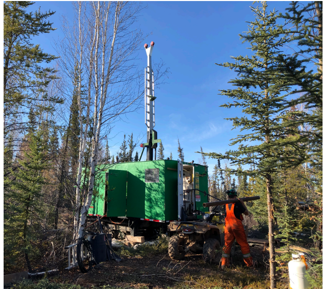
Figure 1: Infill Diamond Drilling North T Zone

Resampling assay results are currently being analysed and together with results from the infill drilling program will form the basis for a revised JORC resource for the North T Zone and initial focus of its start-up operation.