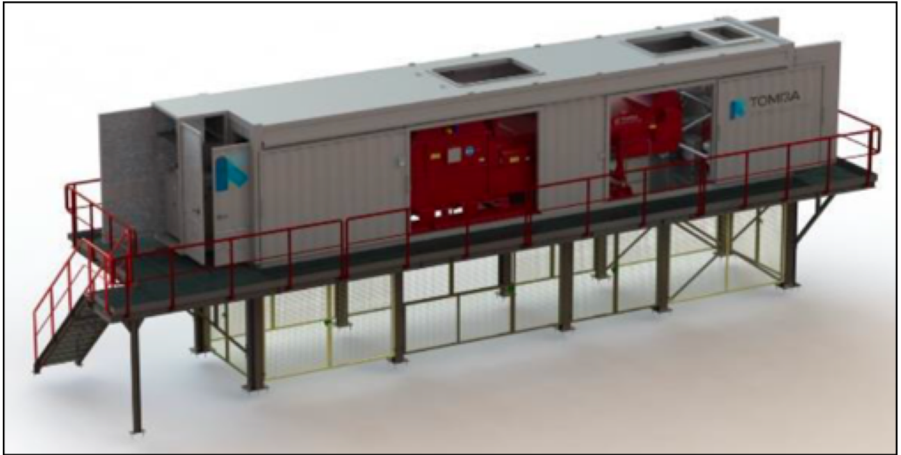
Figure 2: Schematic of Ore Sorter, in place with support structure.

The ore sorting testwork highlighted that the Nechalacho REO Project is one of the few and the first REO project to successfully use ore sorting to produce a high grade +35% REO concentrate without the use of reagents and water. This will substantially reduce the cost and the lead time to bring the Nechalacho REO project into production.