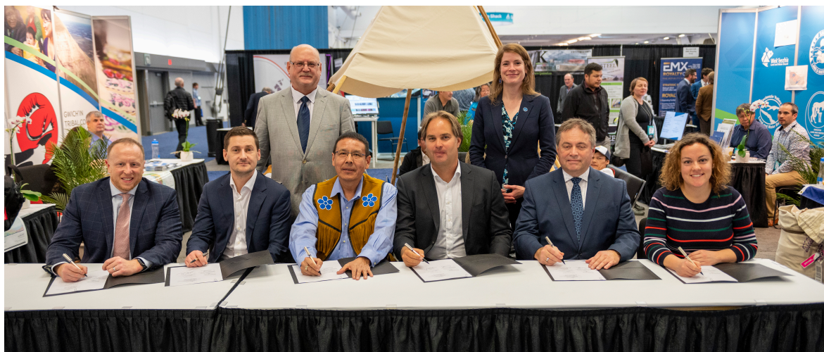
Signing Ceremony with representatives from Cheetah Resources, Det'on Cho Corporation, First Nation and GNWT and Canadian government

Cheetah (Vital's 100% owned subsidiary) has signed preferred mining contractor and ice-road construction contracts with Det'on Cho Nahanni Construction Ltd and Aurora Telecom Services Ltd respectively. These contracts allow for the mobilisation of plant and equipment to site over the winter to enable site establishment works to be completed in preparation for operations to commence in 2020.